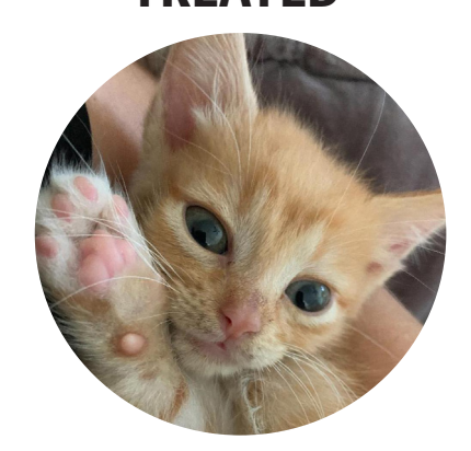
1,386 PUPPIES & KITTENS SAVED