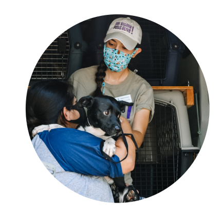
904 RESCUE TRANSFERS