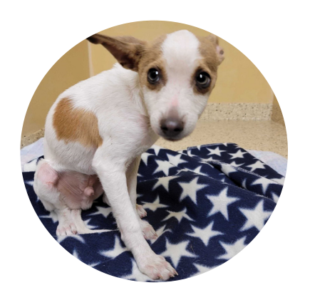
219 PARVO PUPPIES TREATED

80% of the dogs and cats SAPA! saves from euthanasia need some sort of medical care.